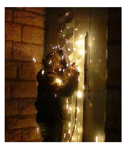
An Israeli soldier welds shut the entrance to Hebron University.

The two universities in Hebron, Hebron University and the Palestine Polytechnic University, were closed by military order for 8 months in 2003, denying over 6000 students their right to education. The gates of the two universities were literally welded shut on 14 January 2003 and remained closed until 12 June, when students of Hebron University, in defiance of the military order, broke down the gates and managed to reconvene classes on the campus for 6 weeks. The Israeli Army reinforced the closure of Hebron University on 30 July, but unexpectedly reopened both universities on 15 August 2003.