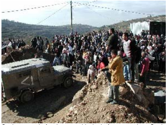
Students and faculty are blocked from passing Surda Roadblock, Photo: Yasser Darwish

Israeli Army checkpoints and roadblocks are sometimes deliberately placed to inhibit access to educational institutions. For two and half years between March 2001 and December 2003, Birzeit University was virtually sealed off by concrete roadblocks and earth mounds on the road to the University from the city of Ramallah. The road was also bulldozed numerous times. Students and staff coming from Ramallah were forced to walk over 2km on foot to get past the roadblock, subject to regular harassment and arrest by Israeli soldiers on the way. With no possible 'security' explanation, the purpose of 'Surda Roadblock' was unambiguous; it was designed to bring a halt to the educational activities at Birzeit University. Over a hundred of Birzeit University's teaching days were lost during this period.