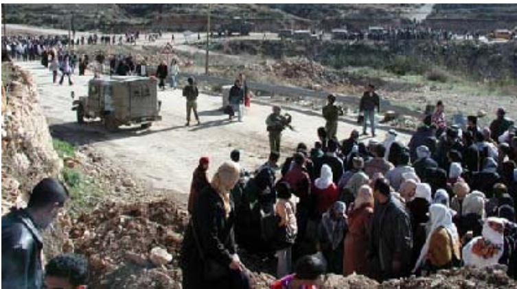
Surda Roadblock between Ramallah and Birzeit University.

In addition to the daily obstacles of checkpoints and roadblocks, the Israeli Army frequently imposes curfews on Palestinian towns and villages, particularly in the northern West Bank and in the southern West Bank city of Hebron. When there is a curfew, getting to school or university becomes impossible, whole school days are missed and schools are effectively closed if the curfew is for prolonged periods. The Palestinian Ministry of Education and Higher Education (MOEHE) reports that 498 government schools were disrupted or closed for varying periods of time due to curfews and closures during the school year 2002-2003, with a total of 1289 schools closed for varying periods since the beginning of the Intifada in September 2000.