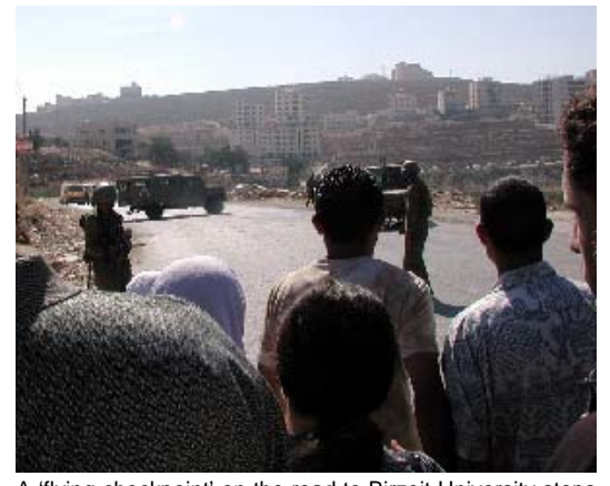
A 'flying checkpoint' on the road to Birzeit University stops students from passing.

The concrete blocks of Surda Roadblock were finally removed in December 2003, but in the six months since then, the road from Ramallah to Birzeit continues to be frequently blocked by Israeli Army jeeps and soldiers. Known as 'flying checkpoints', traffic is brought to a complete standstill, soldiers randomly check ID cards and students are sometimes pulled out of cars and taxis and held at the side of the road. While flying checkpoints are completely arbitrary, staff and students at Birzeit University have noticed certain patterns in their frequency, for example the road to Birzeit is blocked more often at the start of a semester and also during exam time. <sup>10</sup>